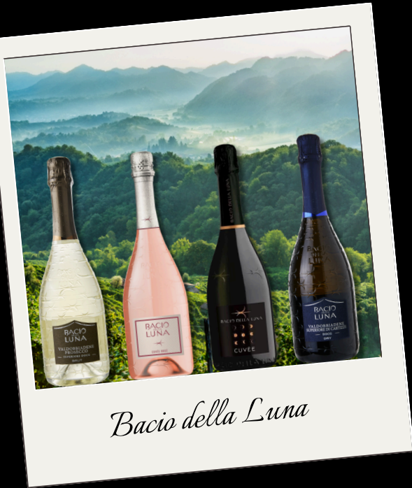
Bacio della Luna

The pursuit of quality is the guiding thread that, over the years, has led Bacio della Luna to develop a range of Proseccos recognized for their balance, freshness, and elegance, the result of a constant dialogue between tradition and innovation, and a vision attentive to the demands of international markets.