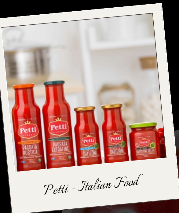
Petti - Italian Food

P.E. Labellers offers its technological innovation for a manufacturer with the highest standards, labelling the over 20 million bottles which Italian Food produces and distributes every year on international markets.