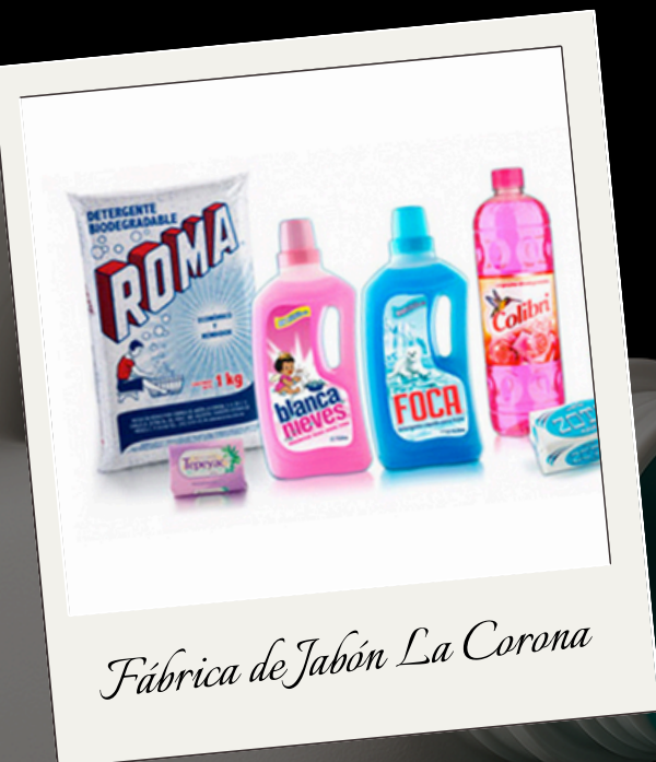
Fábrica de Jabón La Corona

The Mexican company Fábrica de Jabón La Corona is a benchmark in the country and throughout Central America, both in the Food sector, with the production of oils, and in Home Care, with different types of liquid and powder soaps.